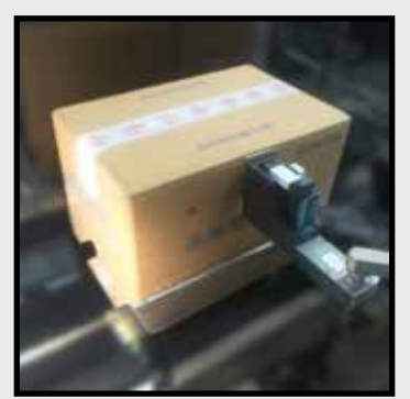
Cardboard box conveyor line