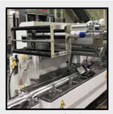
Mounted on a Continuous Motion Flow Wrapper