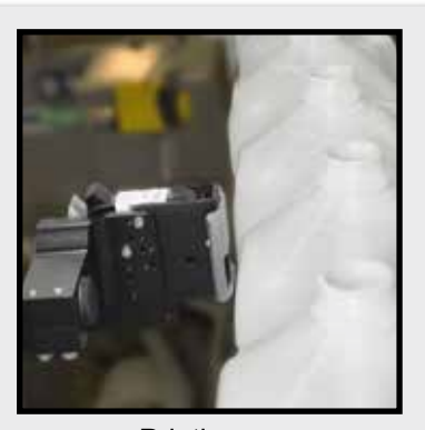
Printing on plastic bottles